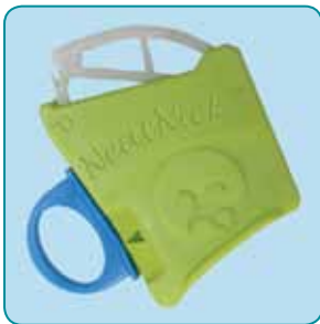
Preemie Lime Green