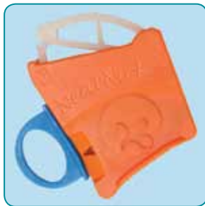
Full-term Mango Orange